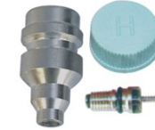
HC. 50.0023 M9x1 R134a \phi 8