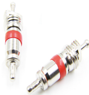
HC.50.2011 Benz Valve core