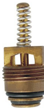
HC.50.2009 Big Buick Valve core