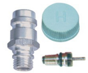
HC. 50.0028 M10x1.25 R134a \phi 9