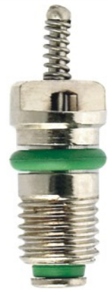
HC.50.2004 R134a Valve core