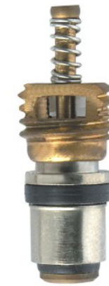
HC.50.2008 Bora Valve core