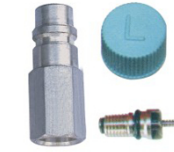
HC. 50.0027 M12x1.5 R134a \phi 10