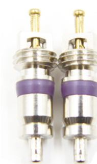
HC.50.2012 Audi Valve core