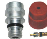
HC. 50.0033 M8x1 M11x1.25 R134a