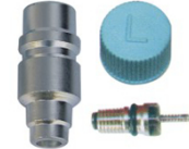
HC. 50.0024 M10x1.25 R134a \phi 7