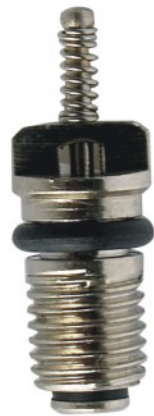
HC.50.2005 R134a Valve core