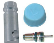
HC. 50.0036 M9x1 R134a