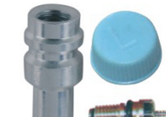
HC. 50.0035 M9x1 R134a